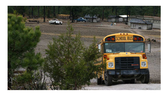
Which sentence provides a better description of the image?