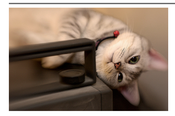
Which sentence provides a better description of the image?