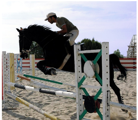
Please describe the image in one complete but simple sentence.