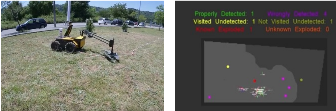
Figure 3: Robot mine detection in Humanitarian Robotics and Automation Technology Challenge 2015.

objective function for lookahead search. Section 4 presents the anytime online POMDP algorithm, which searches a DESPOT for a near-optimal policy. Section 5 presents experiments that evaluate our algorithm and compare it with the state of the art. Section 6 discusses the strengths and the limitations of this work as well as opportunities for further work. We conclude with a summary in Section 7.