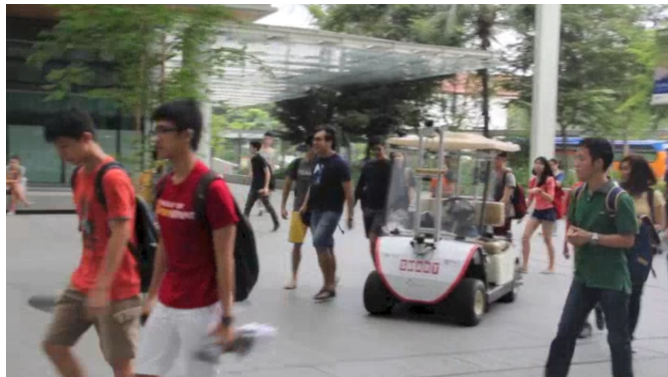
Figure 2: DESPOT running in real time on an autonomous golf-cart among many pedestrians.

tice. We give a competitive analysis that compares our computed policy against near optimal policies and show that K \in \mathcal{O}(|\pi| \ln(|\pi||A||Z|)) is sufficient to guarantee near-optimal performance for the lookahead search, when a POMDP admits a near-optimal policy \pi with representation size |\pi| (Theorem 3.2). Consequently, if a POMDP admits a compact near-optimal policy, it is sufficient to use a DESPOT much smaller than a standard belief tree, significantly speeding up the lookahead search. Our experimental results support this view in practice: K as small as 500 can work well for some large POMDPs.